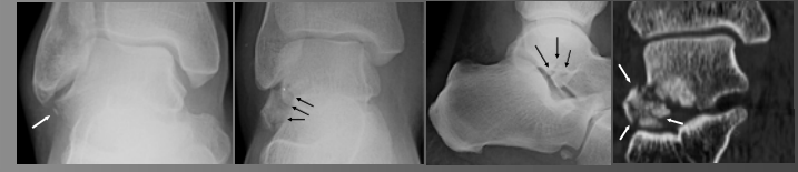
Figure 5. Type I (extra-articular) lateral process fracture visualized on the anteroposterior ankle view. Minimally displaced fragment indicated by arrow. Figure 6. Type III (comminuted) lateral process fracture visualized on the anteroposterior ankle view. Fracture lines indicated by arrows. Figure 7. Type III (comminuted) lateral process fracture visualized on the lateral ankle view. Fracture lines indicated by arrows. Figure 8. Type III (comminuted) lateral process fracture visualized on computed tomography. Comminuted fragment indicated by arrows.